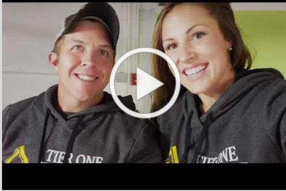
Tier One Nutrition