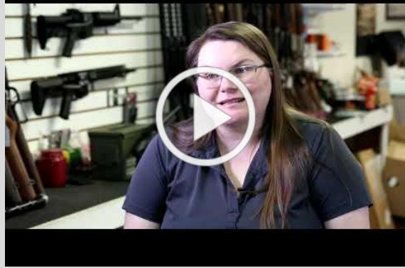
CRC Guns and Weaponry